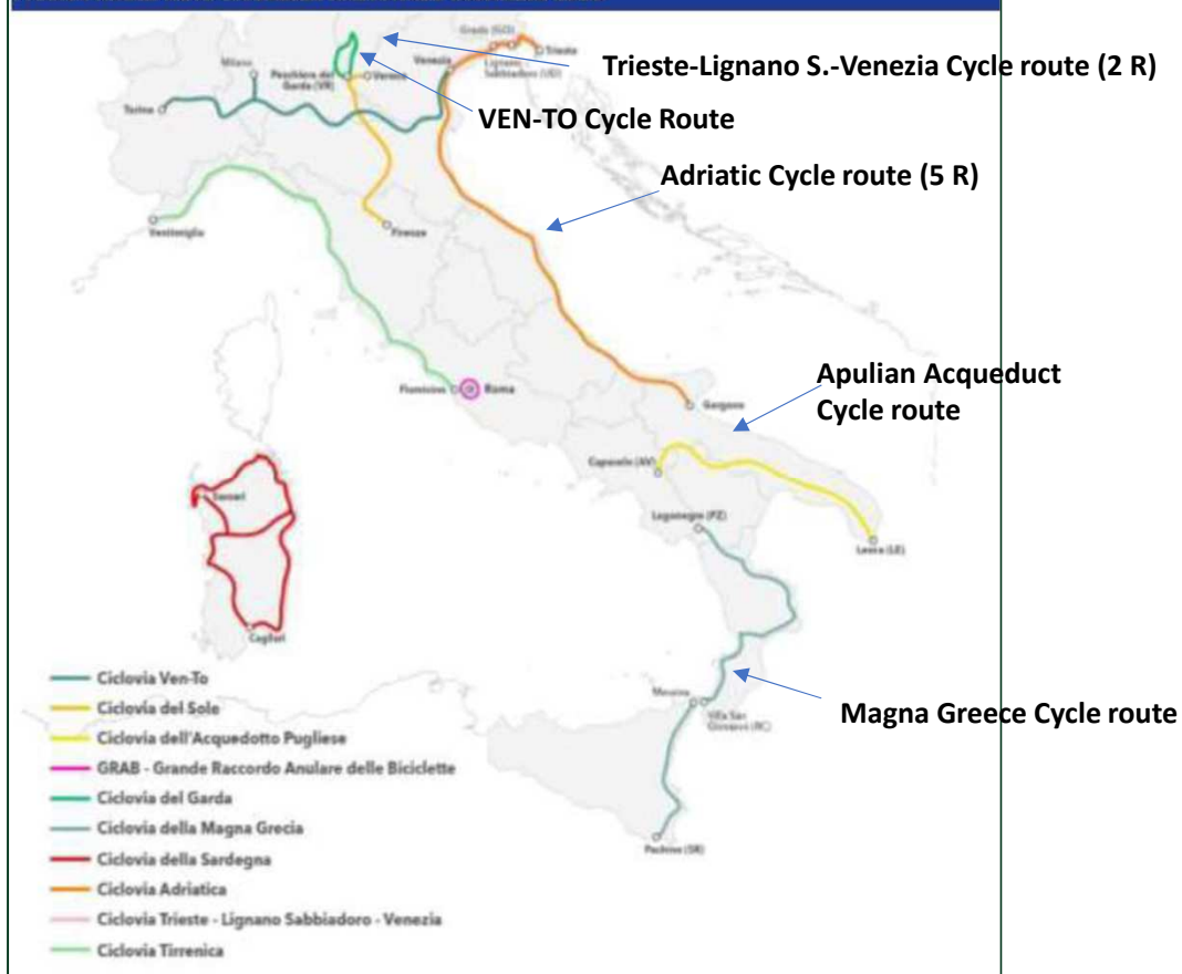
FIGURA III.3.2: RETE CICLABILE NAZIONALE BICITALIA 2020

ADRIATIC-CYCLE ROUTE IN ITALY: 10 Regions