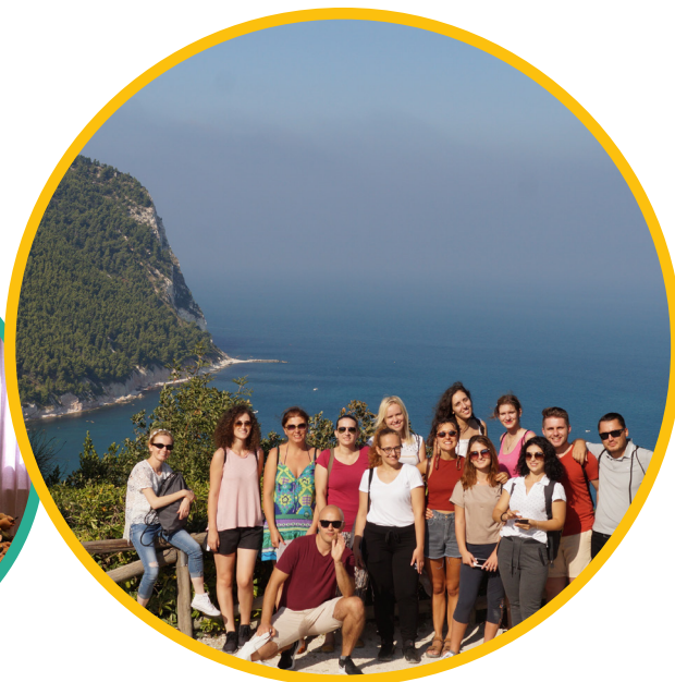
Pictures from AIYOF in Tirana and the EUSAIR Summer School in Ancona, Italy