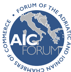
Forum of the Adriatic and Ionian Chambers of Commerce (Forum AIC) www.forumaic.org