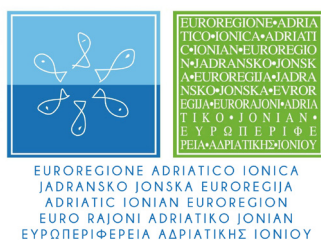
Adriatic Ionian Euroregion (AIE) www.adriaticionianeuroregion.eu