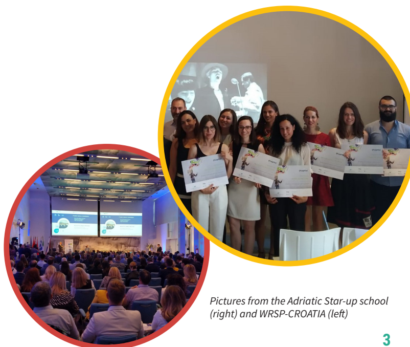
Pictures from the Adriatic Star-up school (right) and WRSP-CROATIA (left)

The workshop was hosted by the University of Sarajevo - centre for Interdisciplinary studies, and aimed to encourage and support the creation of start-ups that link their activities to cultural heritage.