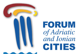
Forum of Adriatic and Ionian Cities (FAIC) www.faic.eu