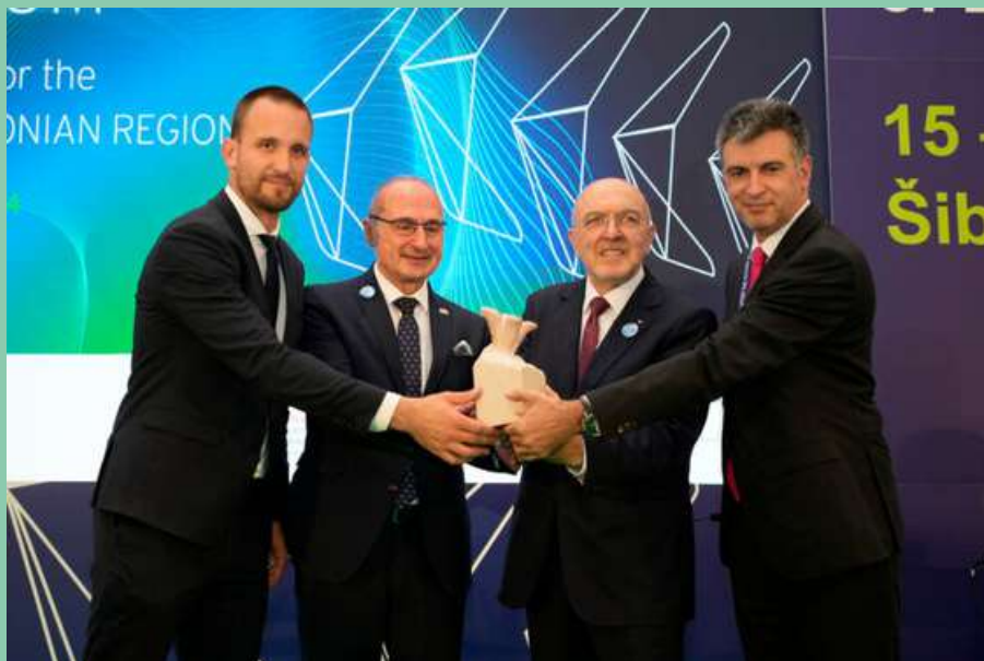
Handover of the Presidency from Croatia to Greece.

The Forum also acknowledged the inclusion of the fifth Pillar “Social Cohesion” , aimed at aligning the Adriatic Ionian Region with with the fourth EU Cohesion Policy objective and the broader framework of green and digital transition.